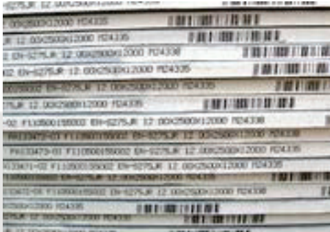
Plate Edge Marking Machine

Edge marking or fixed labeling as we call it allows steel plates to be stacked without losing the possibility for identifying the individual plates in the stack. The marking is black ink characters and a barcode applied by a continuous ink-jet on a ribbon of white paint.