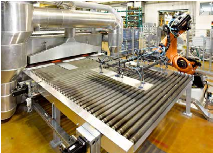
BRAUN CarTec. Germany.

The roller rotation monitoring system allows preventative maintenance to be carried out and malfunctions to be remedied.