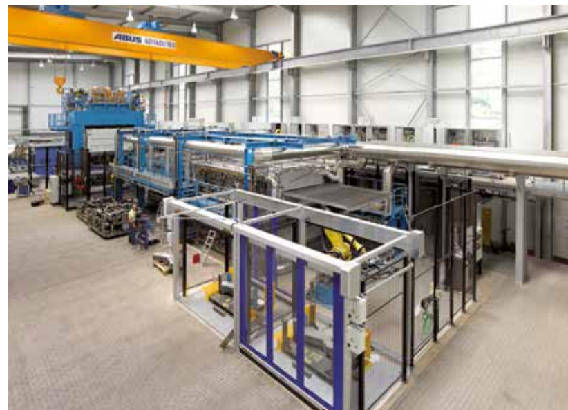
BRAUN CarTec. Germany.