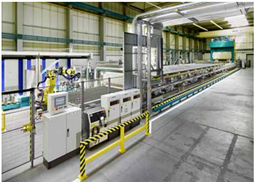
GEDIA Poland. Poland.

EBNER's hybrid heating system keeps investment and running costs low.